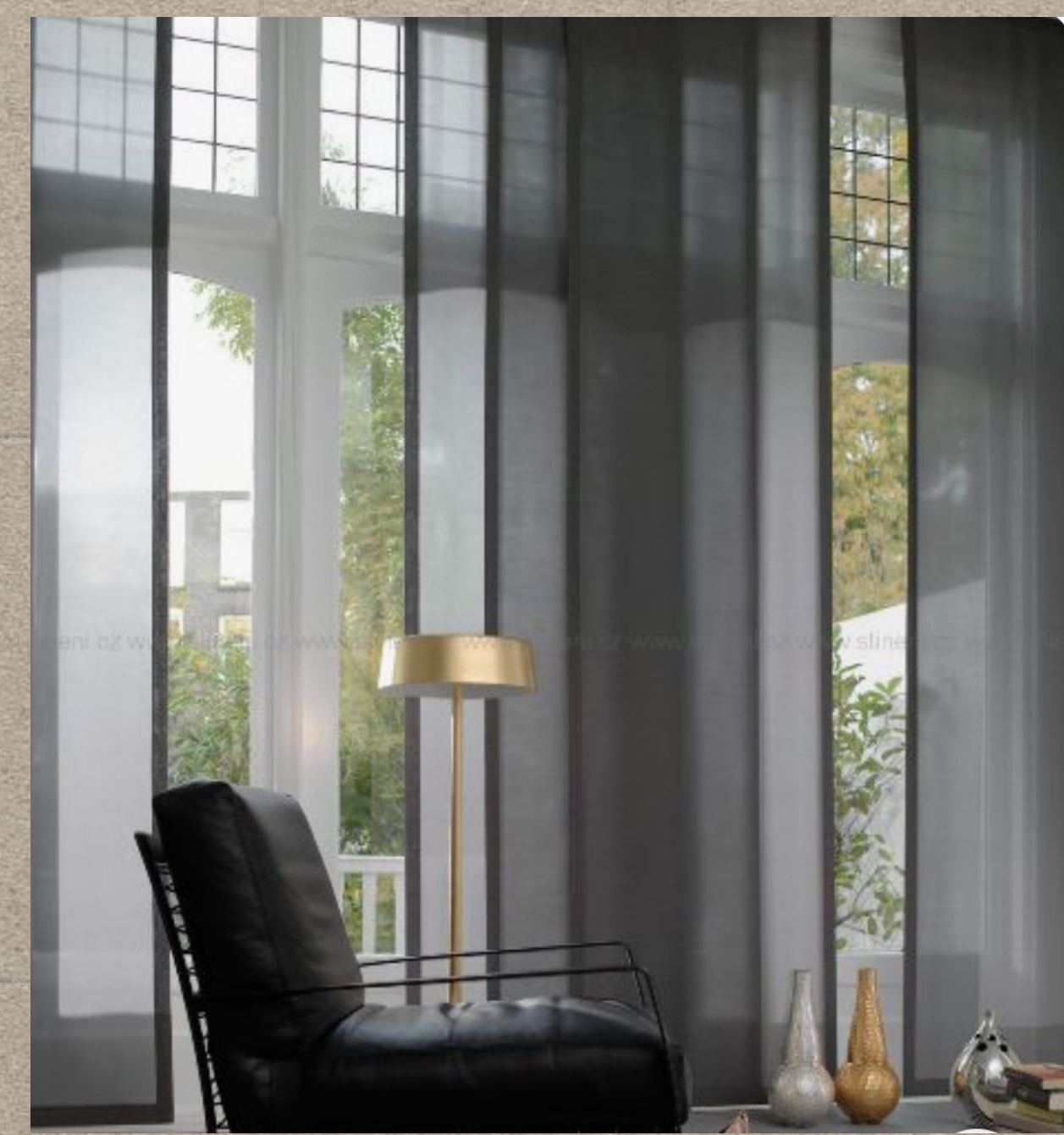
Grey sheer Fabric panels