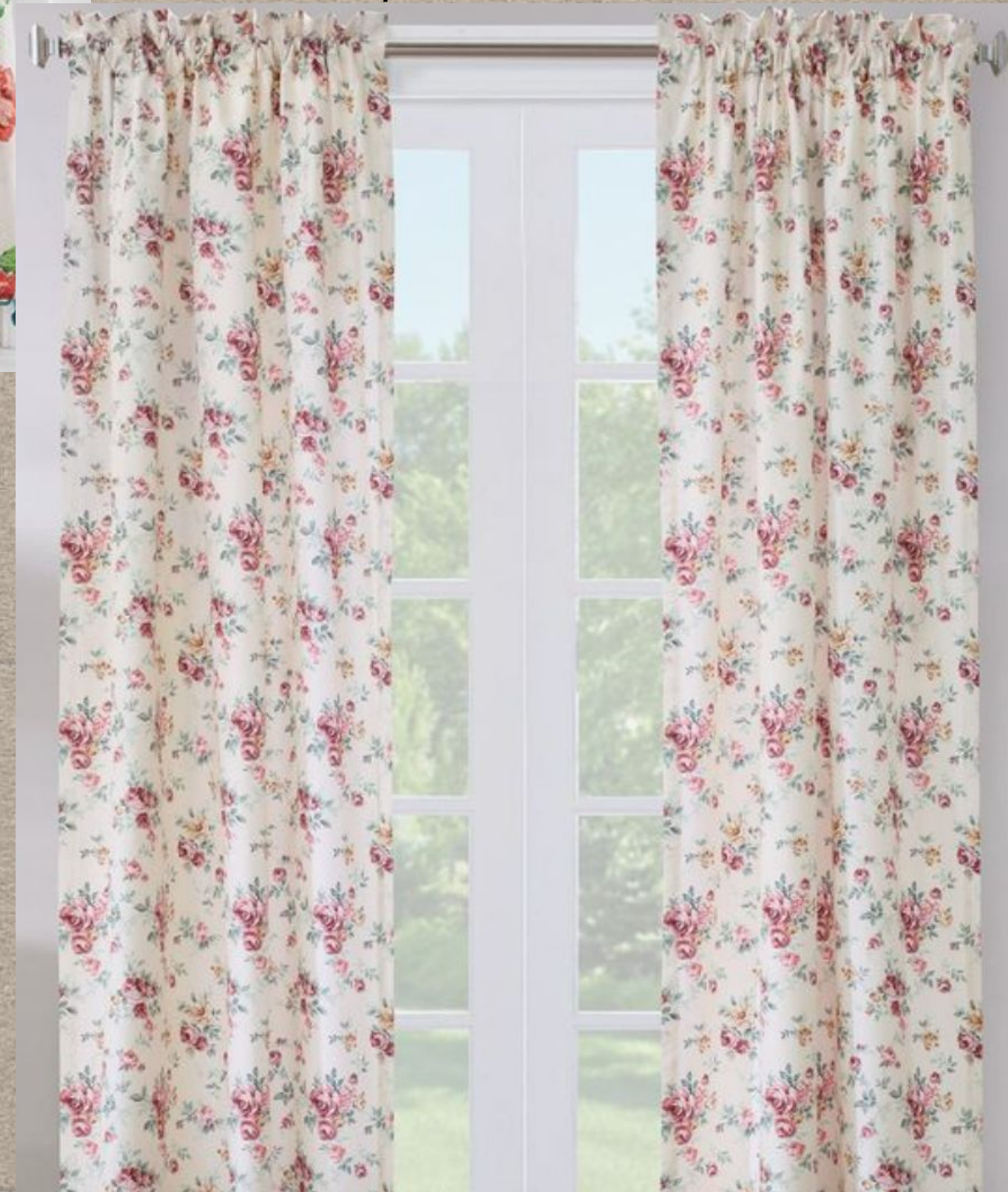
Cotton chintz with pencil Pleat