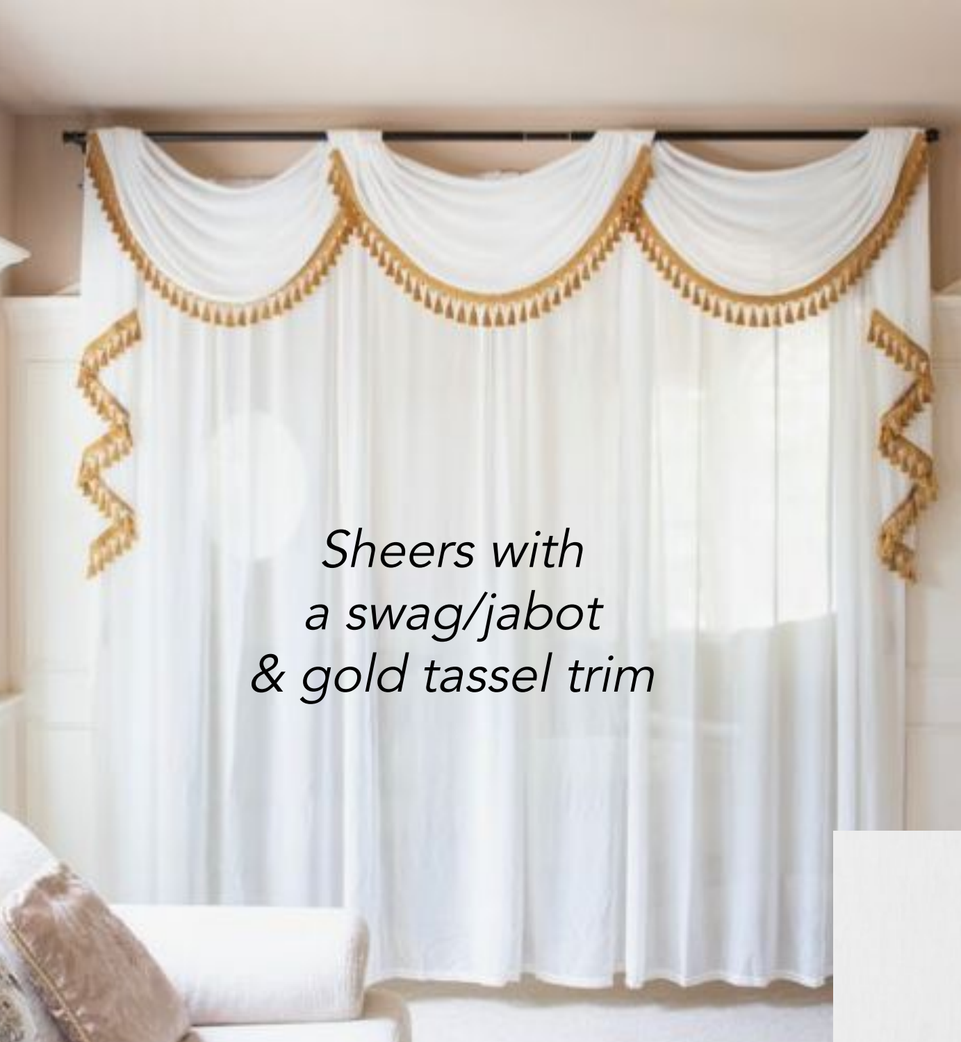
Sheers with a swag/jabot & gold tassel trim