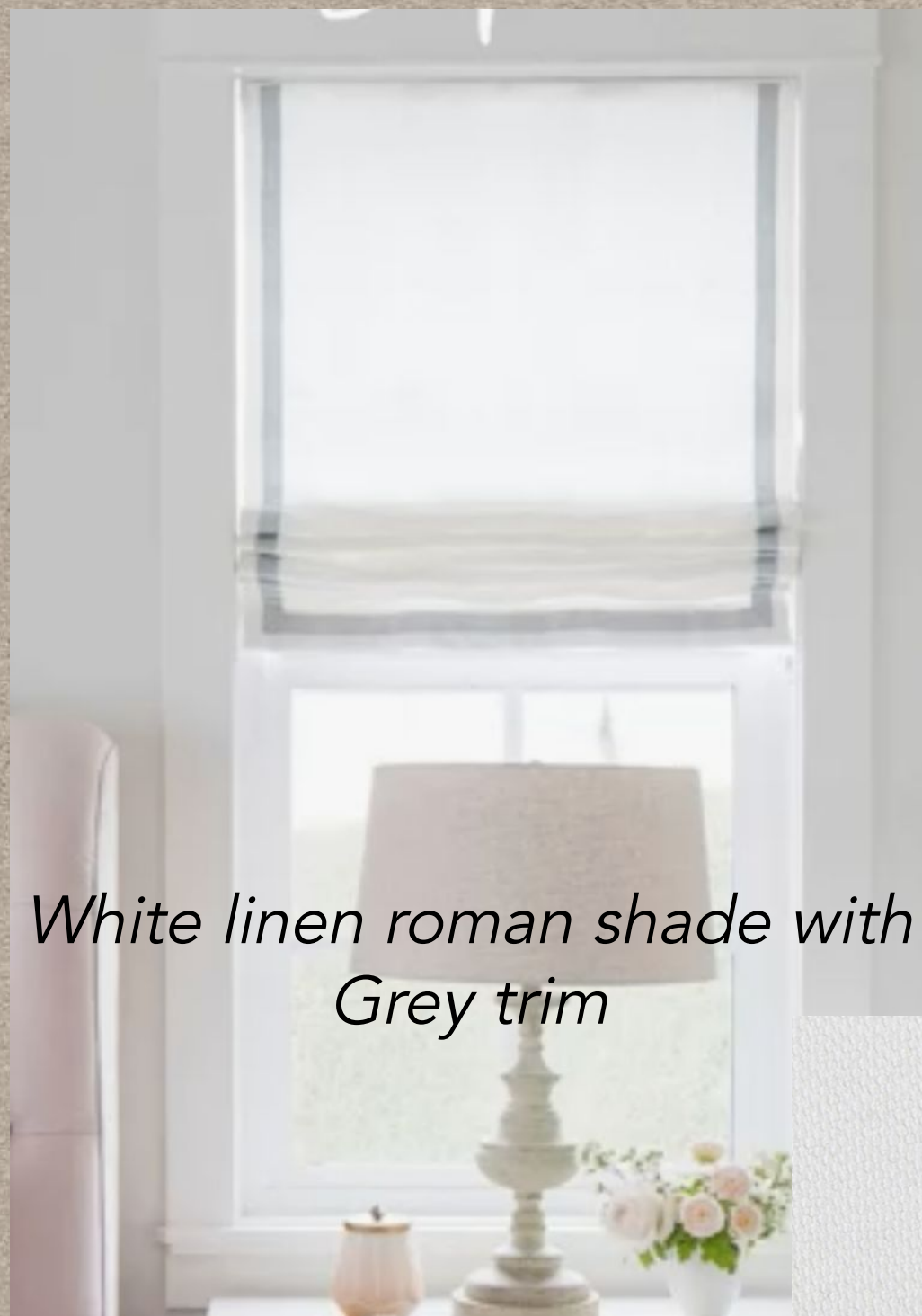
White linen roman shade with Grey trim