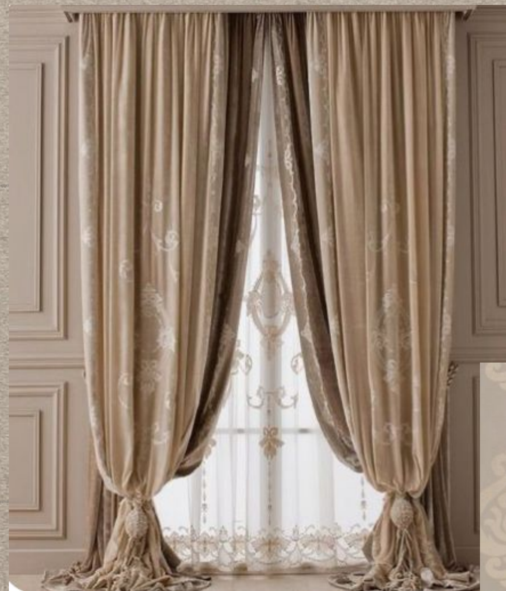
Damask bishop sleeve combo w/ Patterned sheer