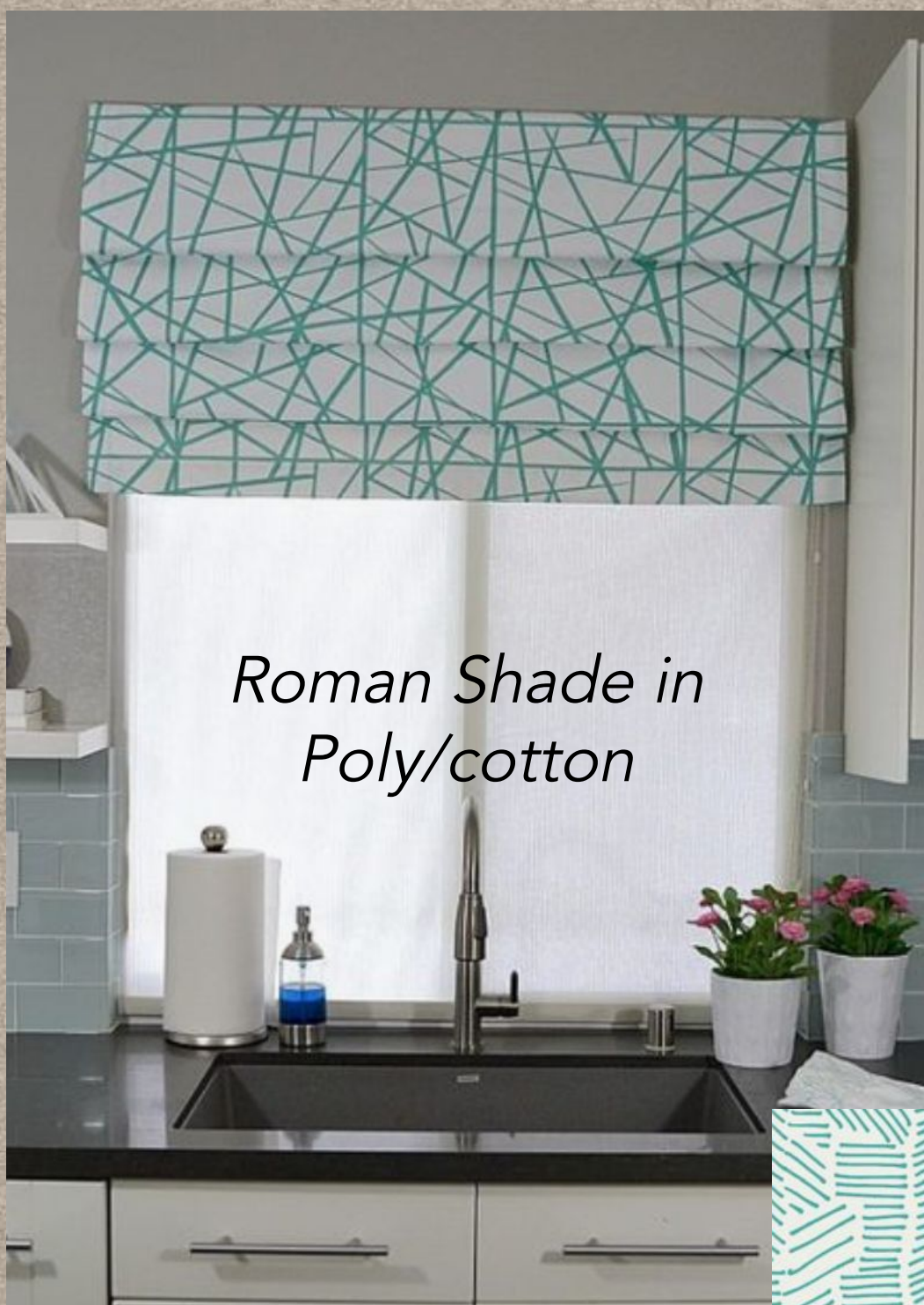
Roman Shade in Poly/cotton