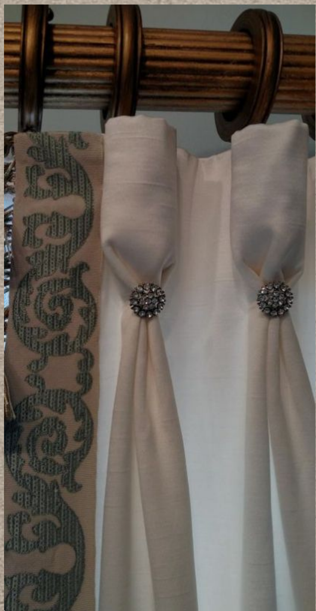
Goblet embellished Pleat with trim