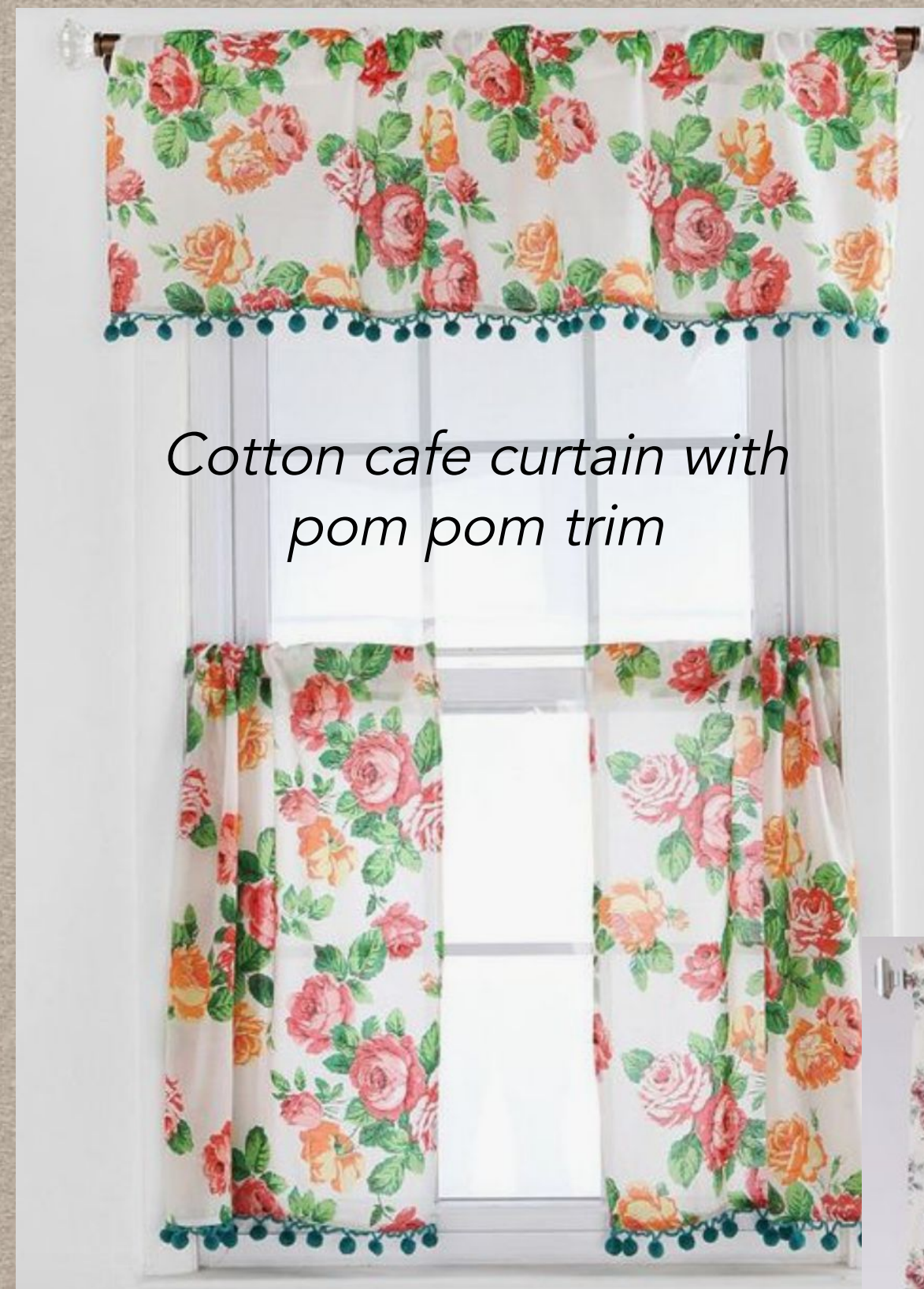
Cotton cafe curtain with pom pom trim