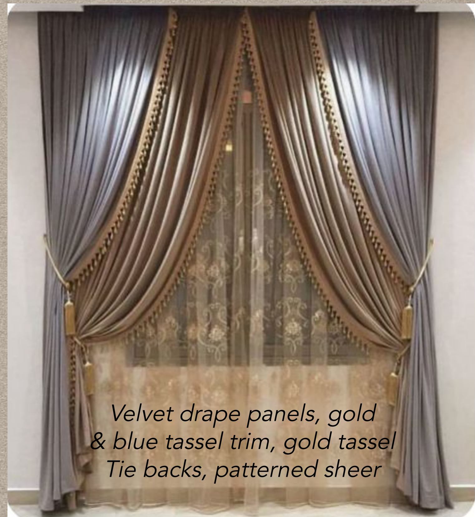
Velvet drape panels, gold & blue tassel trim, gold tassel Tie backs, patterned sheer