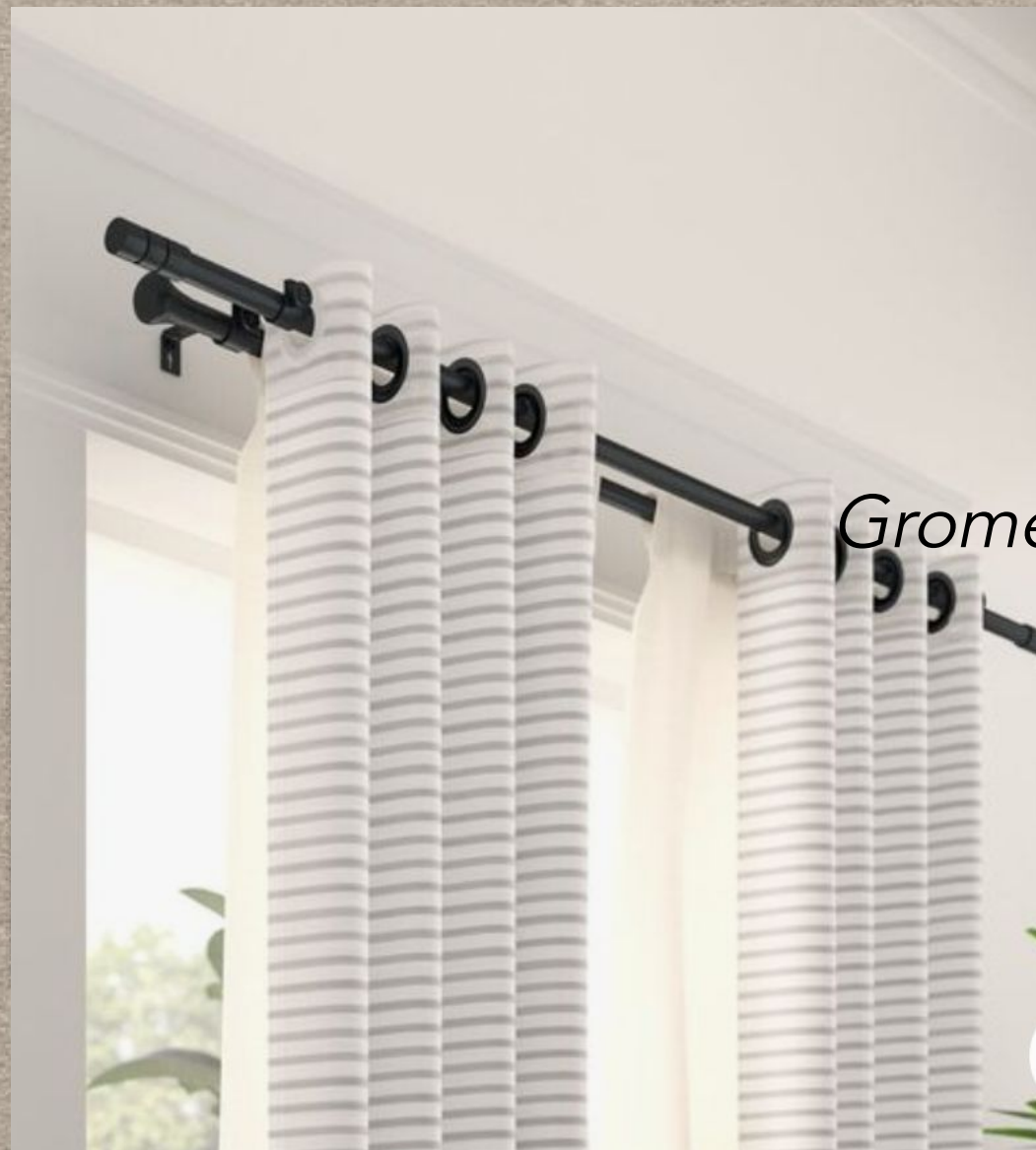
Grommetted cotton stripe (coastal style)