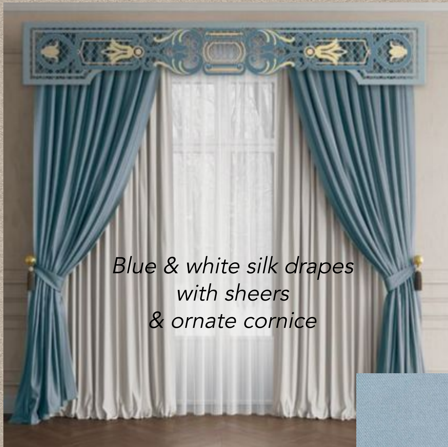
Blue & white silk drapes with sheers & ornate cornice