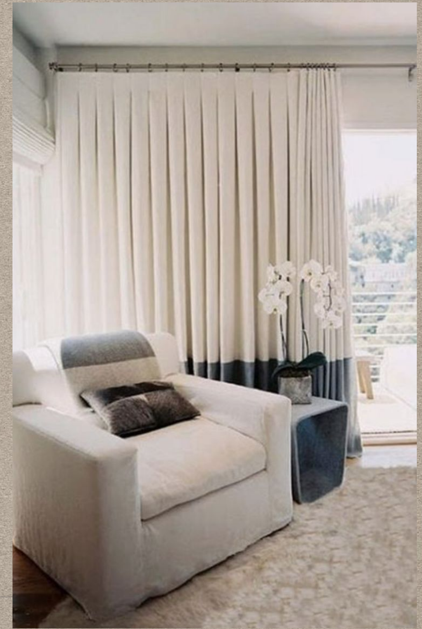
Inverted pleats in cream and blue rayon