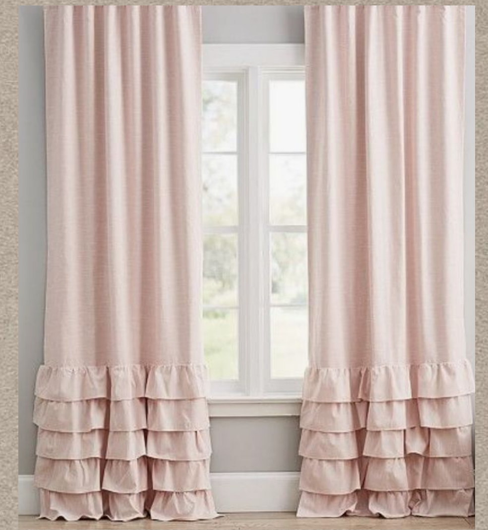
Cotton with ruffle detail