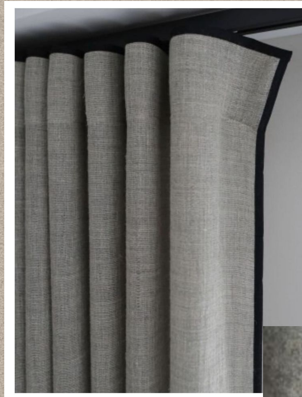
Ripplefold in grey wool With black trim